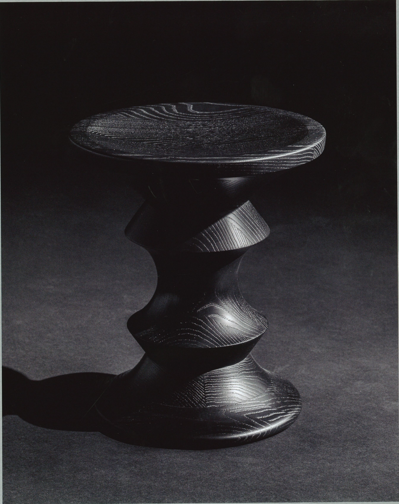
Opposite: Deep Thoughts Chaise and Nosferatube Large Candelabra, Blu Dot Below: Eames Turned Stool – C Shape, Herman Miller